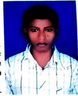
Pl pa he

CP No 187 7.3.22 AFFIDAVIT TO BE FILED BY THE CANDIDATE ALONGWITH NOMINATION PAPER TO THE ELECTION OFFICER /RETURNING OFFICER FOR ELECTION TO OFFICE OF